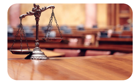
1. Acting Law of the AIFC, which based on the law of England and Wales